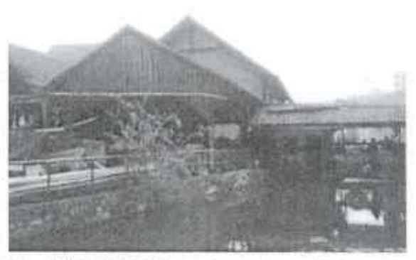
The WINEMILLER Mill at Rumbach as it looks today.